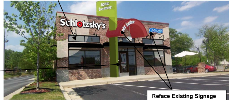
New Street Elevation

Reface Existing Signage and Add New Signage