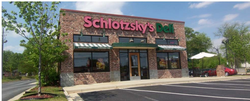
Existing Street Elevation

Add New Vinyl Film on Brick and Perforated Window Film