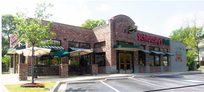
Existing Main Entrance Elevation