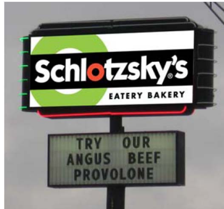
Example of New Pylon Sign