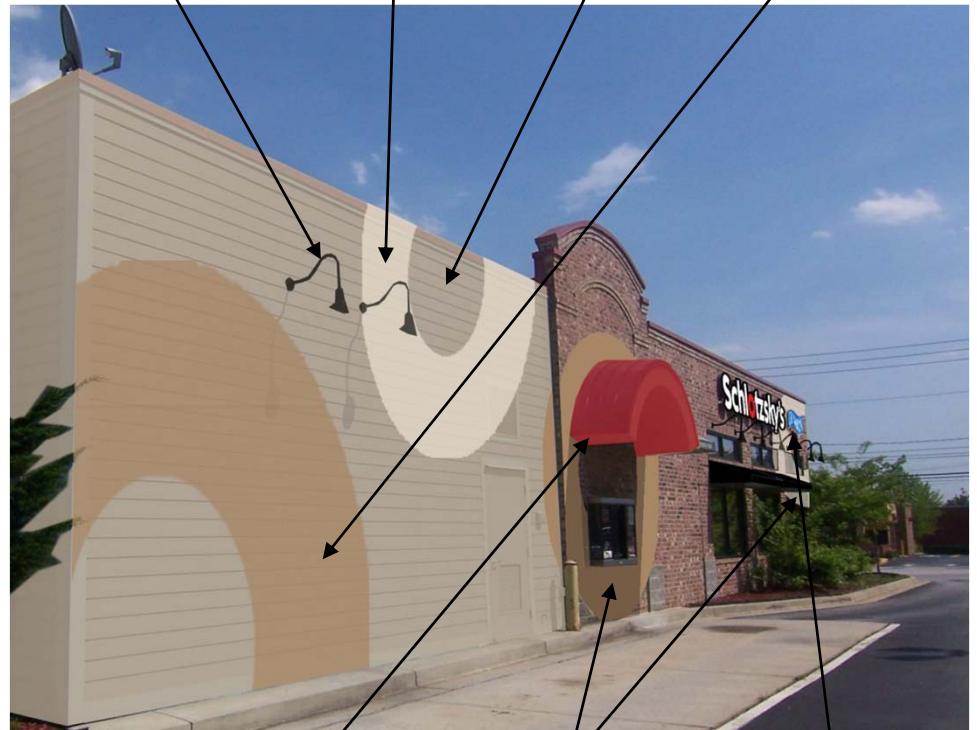
New Drive-Thru Elevation

Add New "Lotz Better" Drive-Thru Barrel Awning (Optional) Custom size, see floorplan