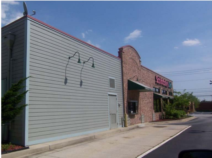
Existing Drive-Thru Elevation

Paint Existing Vinyl Awnings and Gooseneck Lights Sherwin Williams, Black Magic SW6991