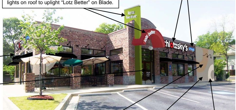
New Main Entrance Elevation

Reface Existing Signage and Add New Signage